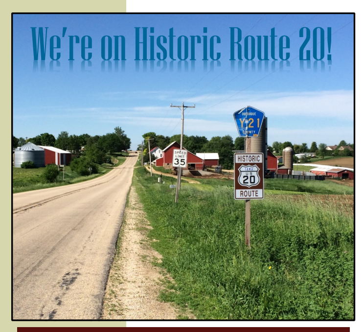
A Historic Route 20 Sign displayed on an original highway alignment in Dubuque County, Iowa.

Your donation will help the Historic US Route 20 Association promote its mission by placing signage along historic alignments of US Route 20.