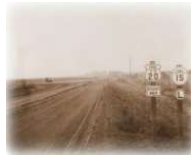
Route 20 in Iowa in 1927

Historical/Educational – A visual historic overview of how Route 20 came into being. From early Native American trails, to the railroads. Route 20 became an early concourse for transcontinental travel. We focus on the overall history of the highway with an emphasis for the locations we are in. Ending with a road trip across America. Each program lasts 1 hour with additional time for Q&A.